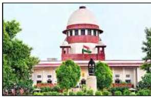
extended to 12 States and union Territories, could not be invalidated merely because it did not conform in every respect to the ordinary modalities con-

NEW DELHI, MAY 27: The Supreme Court on Wednesday upheld the constitutional validity of the Special Intensive Revision (SIR) of electoral rolls carried out by the Election Commission of India, holding that it is well within the powers of the poll panel to undertake such an exercise and that it advances the constitutional goal of free and fair elections. Holding that the SIR exercise, which began with Bihar and was later