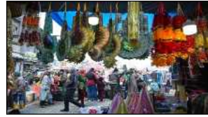
Mumbai, May 27:

Three months after the outbreak of the West Asia conflict, India's economy continues to face mounting external pressures while demonstrating notable domestic resilience in an increasingly challenging global environment. What began as a sudden geopolitical disruption has now evolved into a prolonged macroeconomic condition, steadily weighing on the country's financial and economic systems. The Indian rupee has